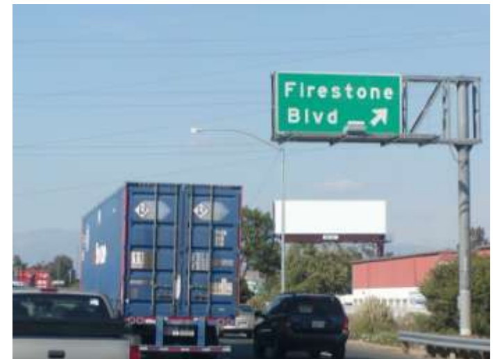
710 Freeway at Firestone Blvd exit