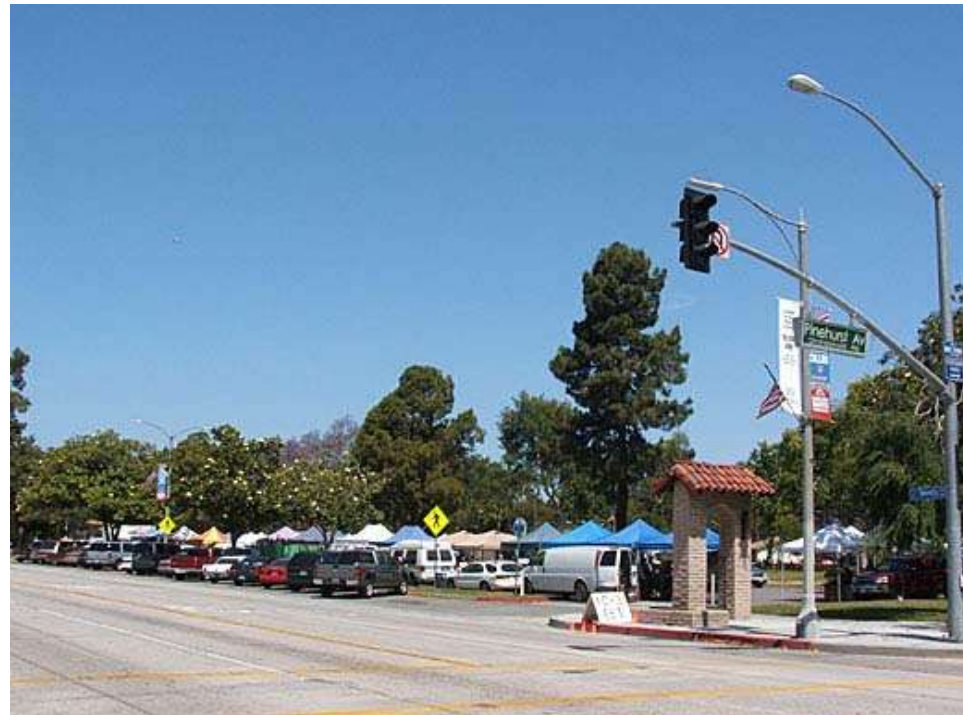
Tweedy Boulevard, South Gate