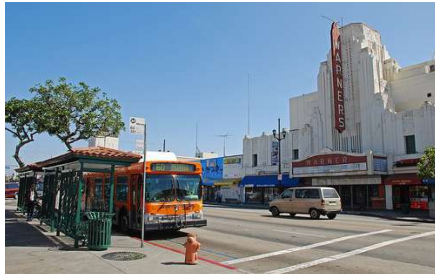
Pacific Blvd in Huntington Park