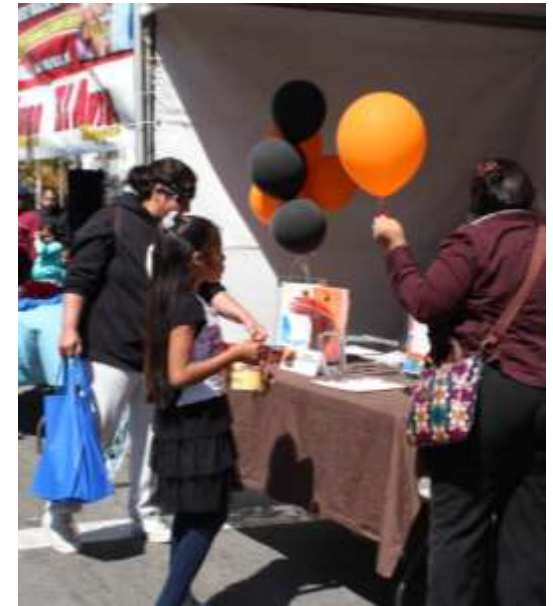
Information table at Huntington Park Festival